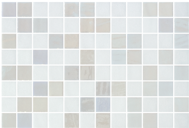
Stoneglass Opalo Blanco

Stoneglass Glass-NP Str-Var [25x25] 311x311 Choose your colour