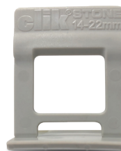
Suitable for stone (14-22mm)