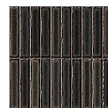
Yakisugi Gloss HB4HC-112

*Please note: colours displayed online should be used as a guide for your product selection. To ensure accurate product selection, visit your local Beaumont store.