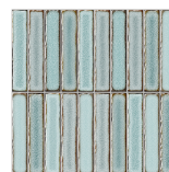
Waterfall Gloss HB4HC-112