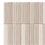
Sesame Gloss HB4HC-112