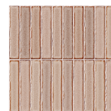
Peach HB4HC-112 Gloss HB4HC-112