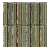
Bamboo Gloss HC2HC-112